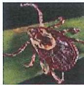
American dog tick