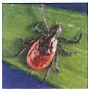
Black-legged “deer” tick