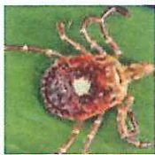
Lone star tick