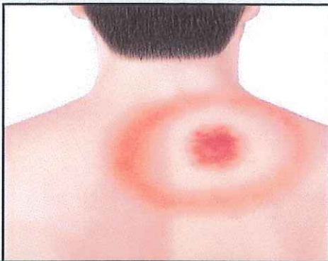
Bull's-eye rash at the site of tick bite. Occurs in 60 to 80% of infected people.

A rash that looks like a bull's-eye, which may be warm to the touch and is rarely itchy or painful, may occur at the site of the tick bite.